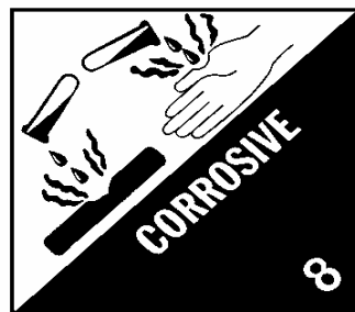
Ethanolamine Solution CLASS 8, UN 2491, PACKAGING GROUP III

Reliable Solutions Inc. believes that the information in this literature is an accurate description of the typical characteristics and/or uses of the product, but it is your responsibility to thoroughly test the product in your specific application to determine its performance, efficacy and safety. Reliable Solutions Inc. provides the sole warranty that the product will meet our current sales specifications. Your exclusive remedy and Reliable Solutions Inc. only liability for breach or warranty is limited to refund of the purchase price or replacement of any product shown to be other than as warranted, and Reliable Solutions Inc. expressly disclaims any liability for incidental or consequential damages.